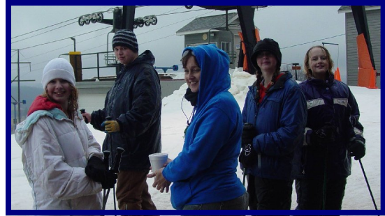
Sports Spectrum Ski Trip, March 3, 2008